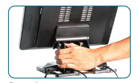
Step 1 Press one-touch button