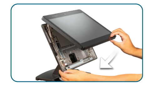
Step 6 Cover the monitor case to complete the maintenance