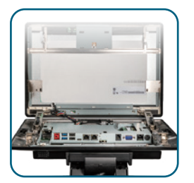
Hidden I/O ports protection