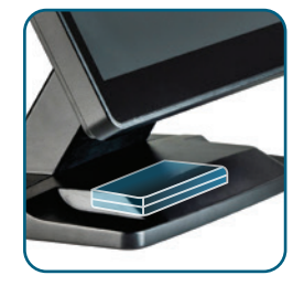
Hidden adapter design