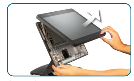
Step 2 Uncover the monitor case